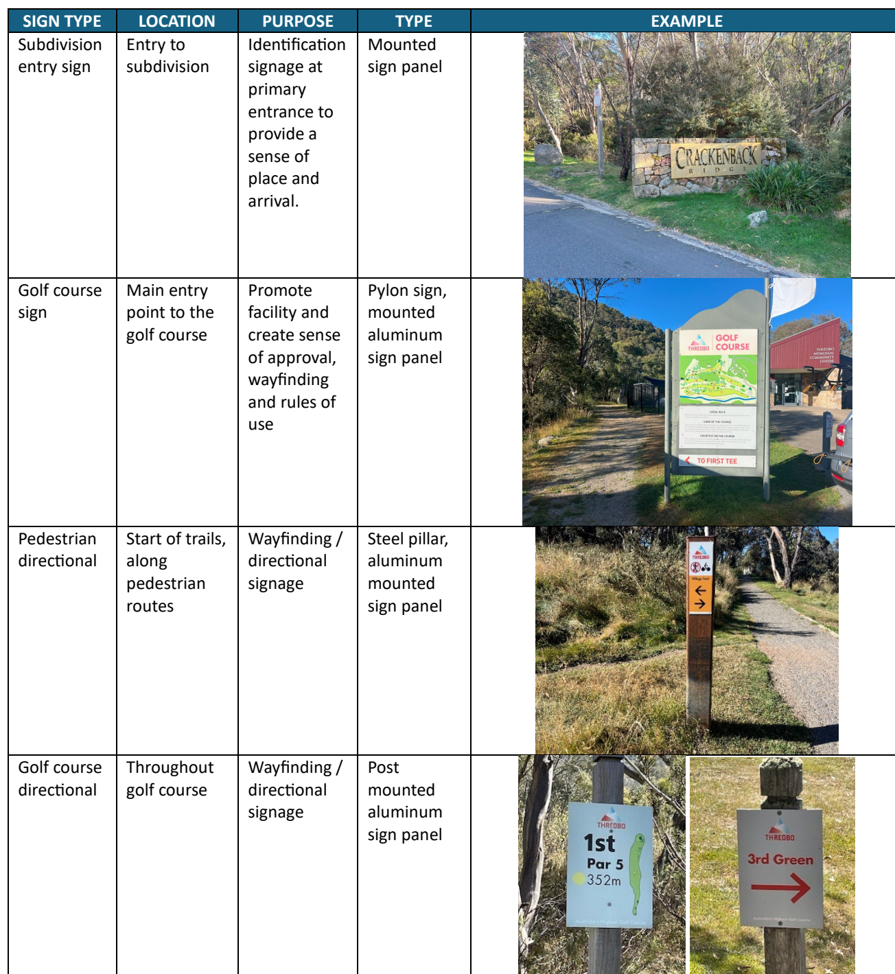
Table 1: Signage examples throughout golf course